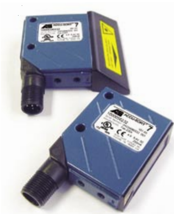
Photo captions: (CLOCKWISE FROM LEFT) Model 7 bar code reader is available in a standard front read version, and a version with a deflecting mirror; Model 7 use in the pharmaceutical industry; Embedded Model 7 bar code scanner.