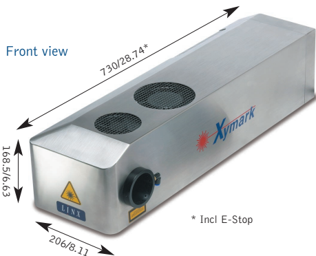
* Incl E-Stop